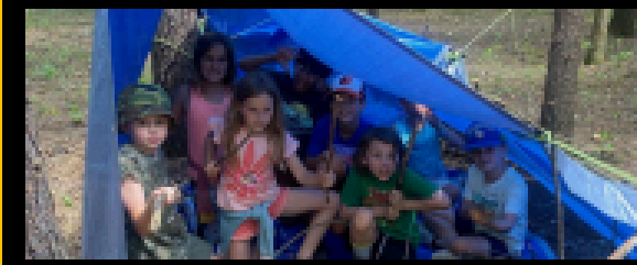
BE A SURVIVALIST (AGES 8-10)!