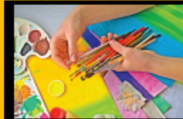
BE AN ARTIST!