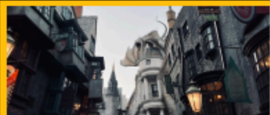
BE A WIZARD!