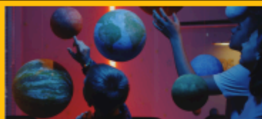
BE AN ASTRONOMER!