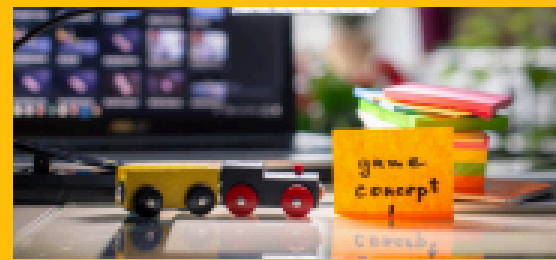
BE A GAME DESIGNER!