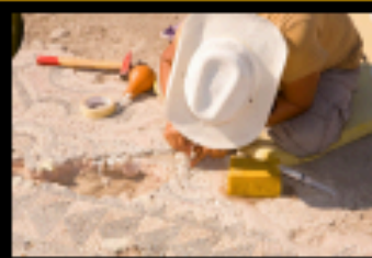
BE AN ARCHEOLOGIST!