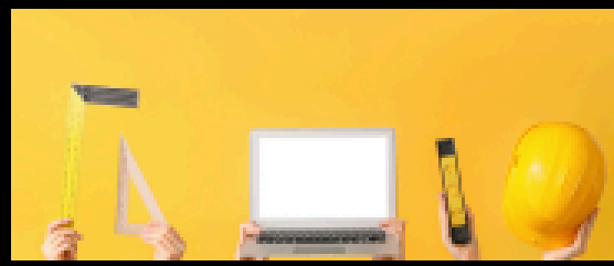
BE AN ARCHITECT!