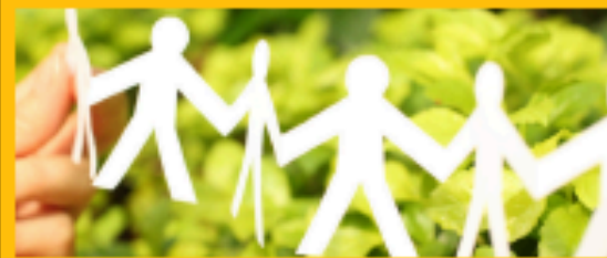
BE AN ENVIRONMENTALIST!