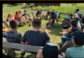
BE A SURVIVALIST (AGES 11-14)!