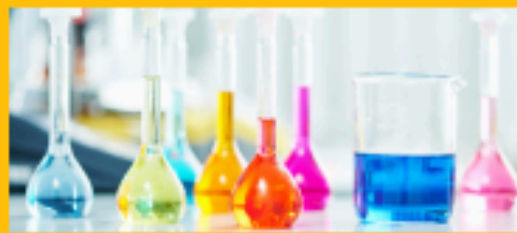
BE A CHEMIST!